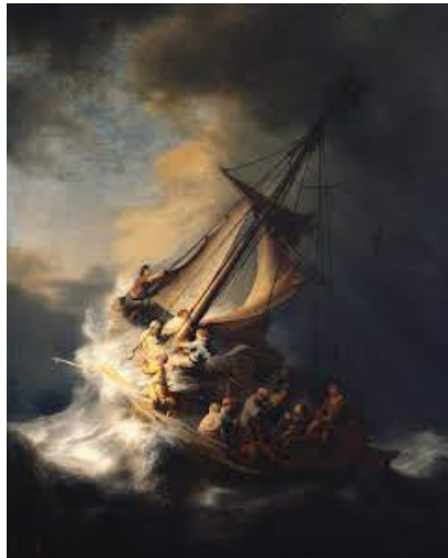
Christ in the Storm on the Sea of Galilee

Today we hear in the Gospel of Mark about Jesus calming the storm saying 'peace be still' and telling his disciples to not be afraid.